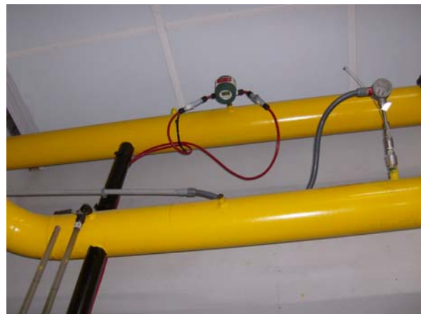
FGF – Sage flow meter, measuring gas to flare