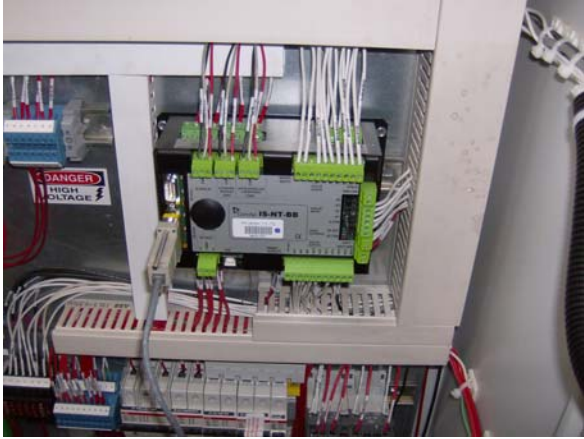
Intelisys NT and output to Carbon Catcher