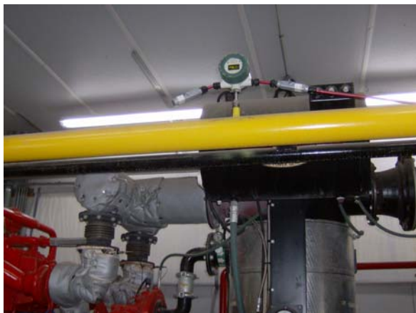
FGE – Sage flow meter, measuring gas to engine.