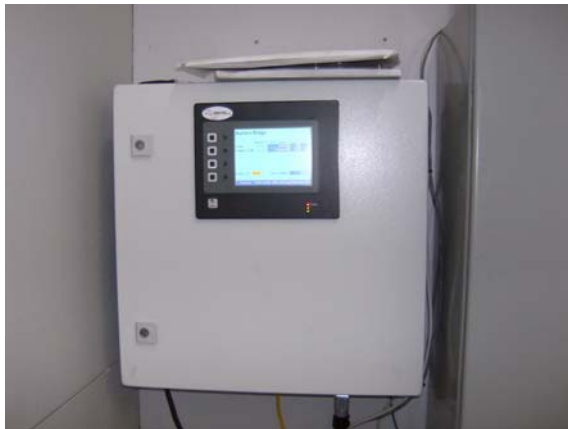
Carbon Catcher Panel – Located in back left corner of electrical room.