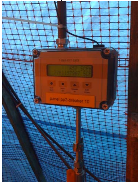
Sage Biogas Flow Meter