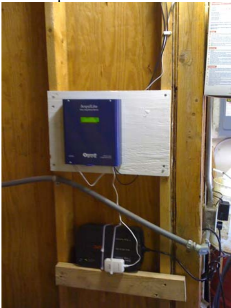
AcquiLite Data Logger