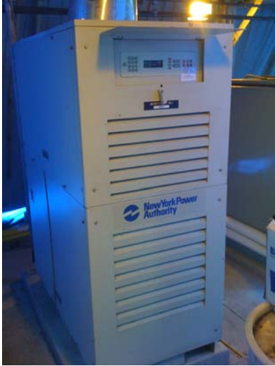
Capstone Micro Turbine