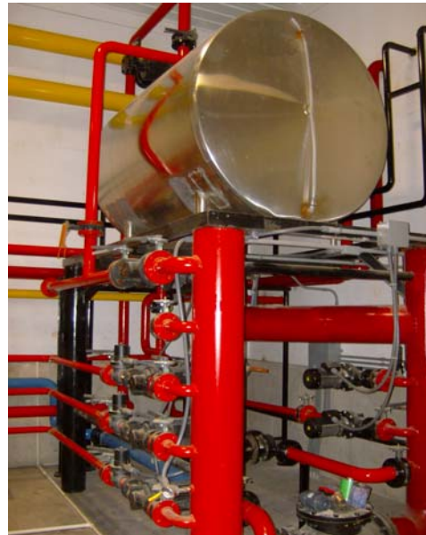
Hot water storage tank and piping