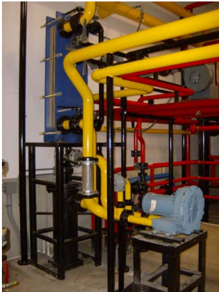
Biogas de-watering heat exchanger; 5 HP blower, and biogas piping to engine