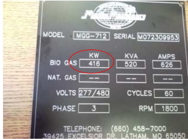
Generator Nameplate: 416 kW