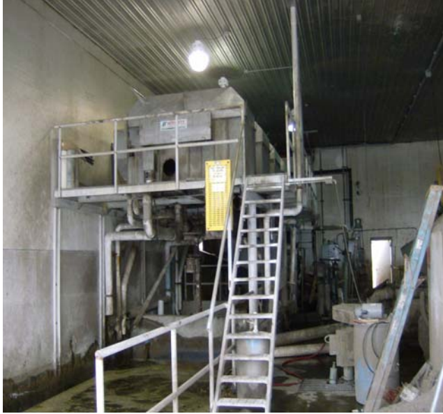
Effluent Separators (4x, raised)