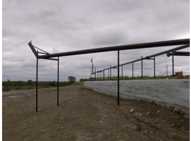
Engine exhaust and biogas flare