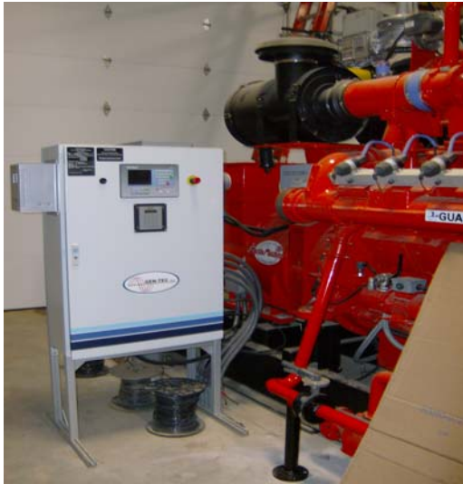
Guascor Engine and GenTec Engine Control Panel