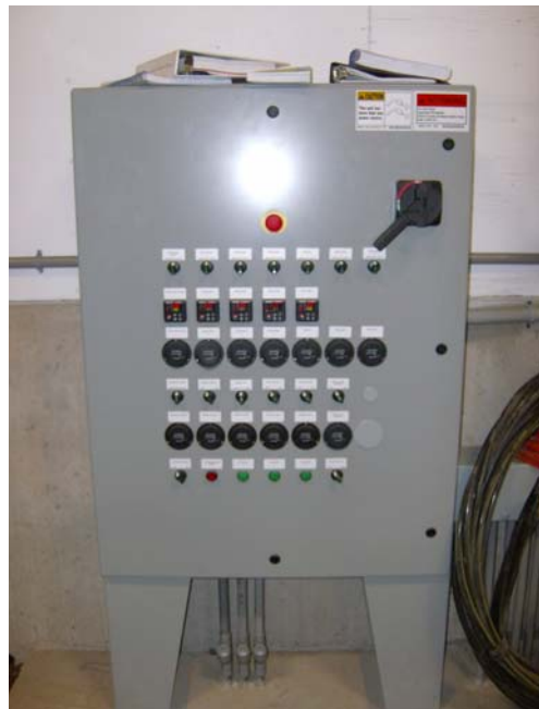
Digester Temperature Control Panel