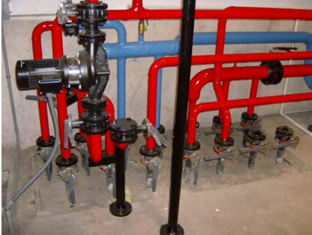
Digester heat piping