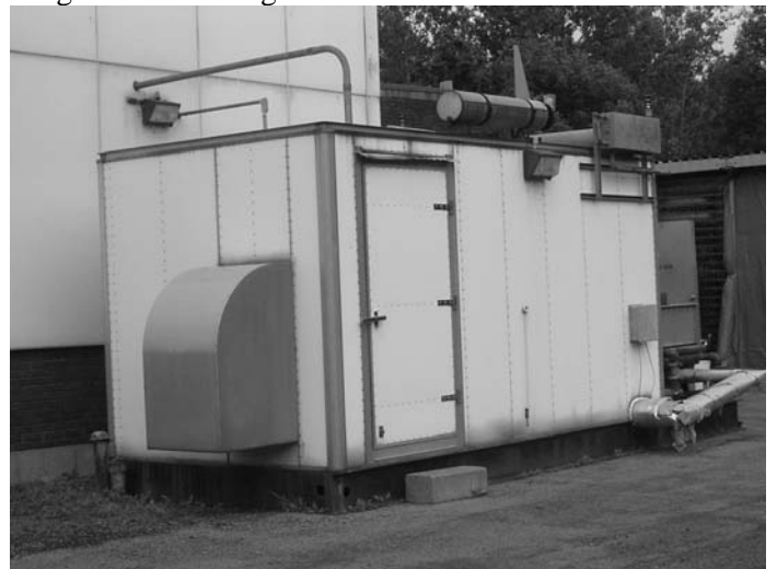
Backup 100kW Generator