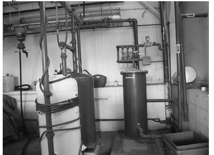
Biogas Conditioning Skid