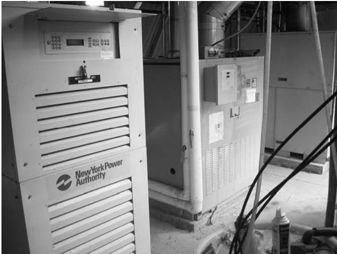
MT #1, Air to Liquid Heat Exchanger, MT #2