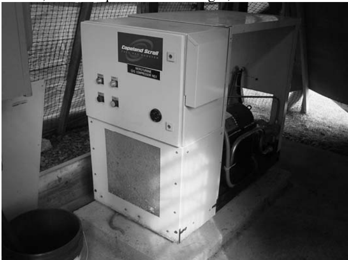
MT #1 Gas Compressor