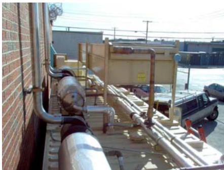
Field Assembled Mechanical Equipment

Hourly data have been collected from the site since May 2005 and are available on NYSEDA's DG/CHP web site. Performance data from 2006 indicate the CHP system produced in excess of 1,000,000 kWh and reduced 4C Food's energy costs by 38%. Expenditures for utility supplied electricity were reduced by more than $280,000 under the applicable Consolidated Edison rates. Overall savings approached $17,000 per month. The high level of thermal utilization contributed significantly to the savings. Reports from the site indicate 96% of the thermal energy available from the CHP system was usefully recovered. The CHP system is expected to reduce net carbon dioxide emissions by 720 tons annual.