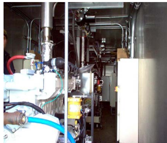
Engine Modules Housed Inside Shipping Container

Since most of the HVAC equipment was in need of replacement, 4C Foods decided to install absorption chillers and convert the fan coils to use hot water at a supply temperature compatible with an engine based CHP system. A new hot water coil was similarly installed to pre-heat the air flow to the cheese dryer and further offset the demand for steam.