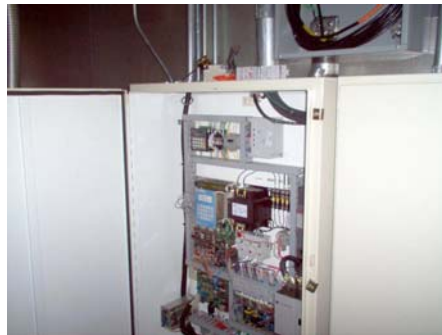
Pre-wired Control Panel