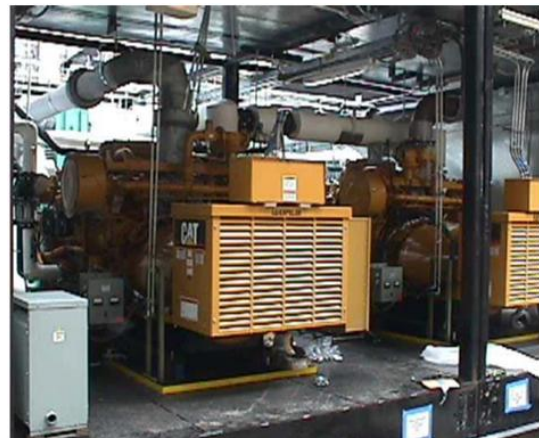
Engine Modules Installed Side-by-Side on Roof

The CHP system is configured on two engine-generator sets that run during the on- and mid-peak periods reducing consumption of utility power at the most expensive time of day. Synchronous generators were used so power can still be supplied to the building in the event of a prolonged blackout. The system was built up from pre-assembled modules that form a sound attenuating structure on the 15 th floor setback. Heat recovered from the engines is recovered as hot water that is used to provide space conditioning.