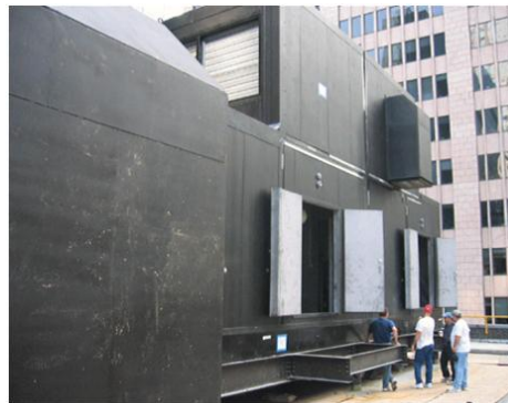
Finished Sound Attenuation Enclosure