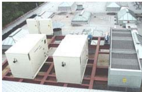
Engines & Auxiliary Equipment During Installation