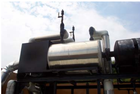
Exhaust-to-Water Heat Exchanger

Monitored data are being collected from this site and displayed on the web by Connected Energy. The collected data includes generator power output, facility utility power import, engine gas consumption, and heat recovery temperatures and flows. Hourly data from this site have been automatically loaded into NYSERDA's DG/CHP data system since March 2005. The CHP system uses most of the available waste heat and has a total system efficiency over 80% on an HHV basis. Monthly utility cost savings are about $10,000 per month under Consolidated Edison rates.