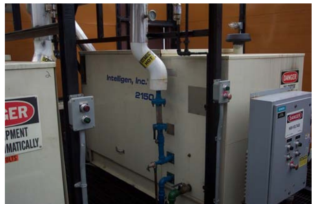
Rooftop-Mounted Engine Modules

Simple Payback: Under 3 years (estimated)