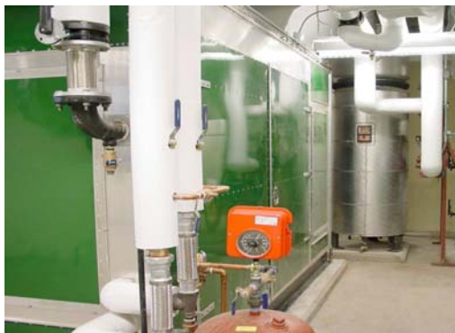
Exhaust Heat Recovery Unit at rear of Engine

Hourly data have been collected from the site since August 2007 and are available on NYSERDA's DG/CHP web site. The system will produce approximately 2 million kWh annually and save the school $200,000 or more. Other ECMs (lighting and HVAC retrofits) implemented coincidentally by Atlantic Energy Services may increase the savings to $300,000 per year. A 13 year payback is expected on Fonda-Fultonville's expenditure in the combined measures. The greater efficiency of the CHP system should yield a significant reduction in carbon dioxide emissions as compared to using separate purchased electric and thermal utilities to provide the same service.