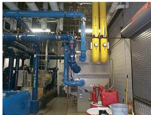
Absorption Chiller Provides Air Conditioning