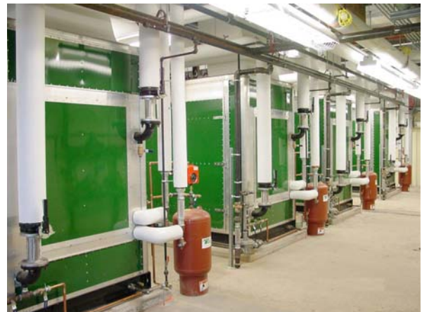
Engine-Generators in Sound Attenuation Enclosures