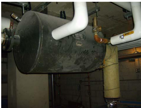
Exhaust Heat Recovery Heat Exchanger

Monitored data are being collected from the site and are available in an hourly format on NYSERDA's DG/CHP website starting from March 2008. The CHP system should reduce the consumption of utility purchased electricity by almost 2 million kWh annually and the average demand by 240 kW. A payback period of 4.1 years is expected based on estimated annual energy savings of $264,000 operating at a peak efficiency of 72% HHV. The greater efficiency of the CHP system as compared to using separate electric and thermal utilities should yield significant reductions in carbon dioxide emissions.