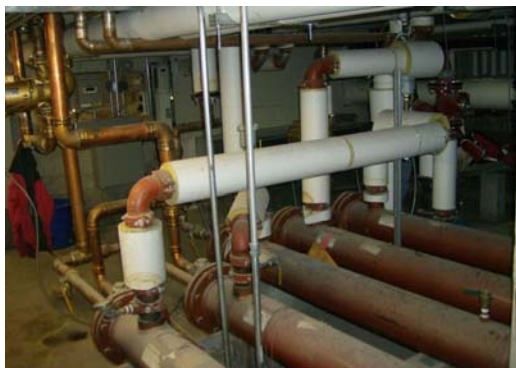
Heat Exchanger Network Serving End Uses