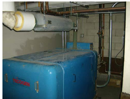
Single CHP Module Shown During Installation

Because of these circumstances, River Point chose to install a CHP system; technology that could impact all of the utility services. River Point worked with American DG Energy who took ownership of the equipment and responsibility for its ongoing maintenance and operation. Five 75 kW Tecogen CHP modules were installed along with a 200-ton engine driven chiller that should curtail use of the absorption machine.