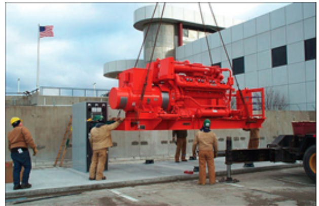
750 kW Engine Generating Set During Installation

Siemens installed two 750 kW generators that currently produce most of the airport's electricity and serve as backup in the event of a blackout. Heat recovered from the engines is used to offset both space heating and cooling loads. Energy consumption at the airport has been reduced almost 50% because of the combined effect of the CHP system and other ECMs.