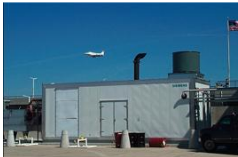
Generator Package Outside Concourse