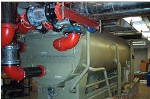
Installed View of Absorption Chiller

GRIA is guaranteed annual savings of $500,000 for all of the ECMs implemented through the contract with Siemens. This ensures the county's $2 million capital outlay will be recovered within ten years. However, payback is likely to be achieved in less time as energy prices continue to escalate. Carbon dioxide emissions should be reduced by 2,260 tons annually due to the greater overall efficiency of the CHP system compared to the conventional operation. Monitored data are being collected from the site and are available in an hourly format on NYSERDA's DG/CHP website starting from July 2006.